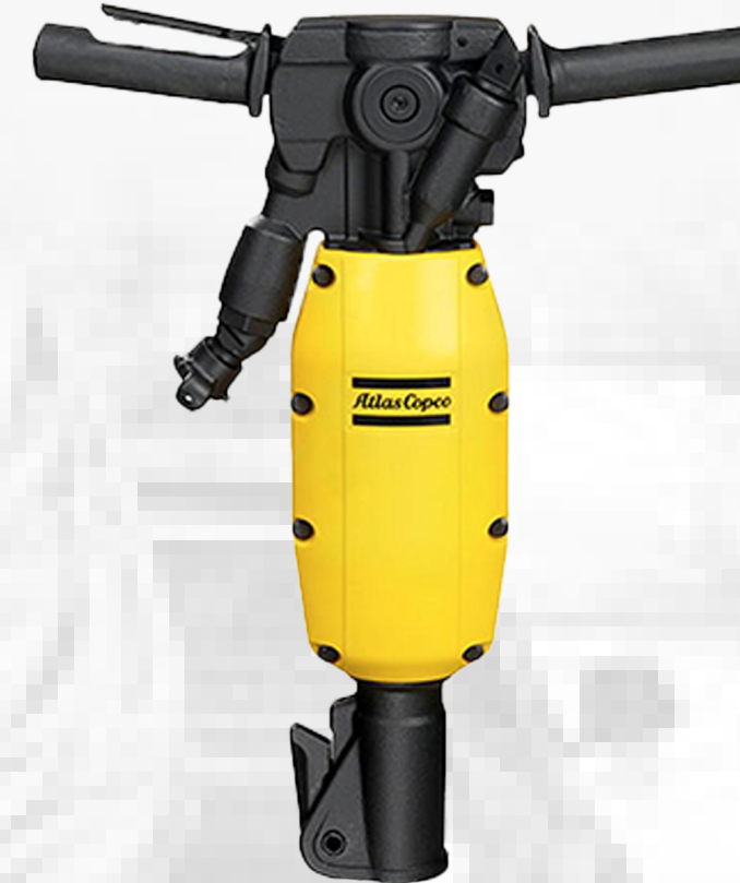
TEX 150 PE