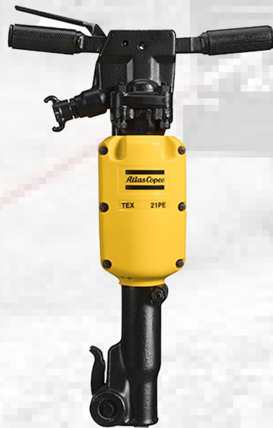
TEX 21 PE