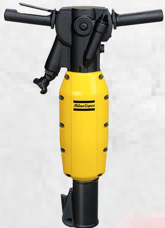
TEX 280 PE