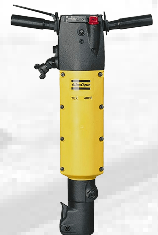
TEX 40 PE

RMT pneumatic breakers are available in weights, ranging from 35 lb to 90 lb class (20 kg to 41 kg) . The hammers are available with different shank size, varying from 25 mm to 32 mm shank (1" to 1¼") . These air tools are capable of light, medium and heavy duty jobs such as demolition, construction, renovation, road construction, bridge work and street repairs. Depending on the job in hand, users will find the most suitable breaker in RMT range . Being considered as the "manufacturer of high quality Paving Breakers from India", all our breakers are manufactured with the goal of providing "Operator's safety, maximum power, maximum durability, easily serviceable and affordable price"