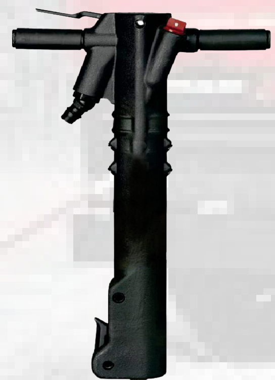
TEX 20 PS