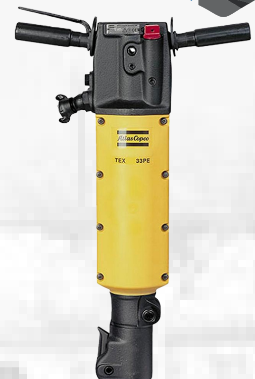
TEX 33 PE