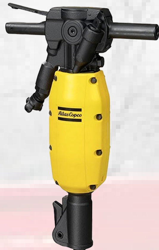
TEX 140 PS