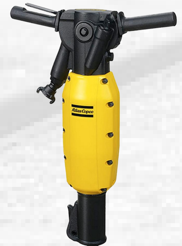
TEX 280 PE