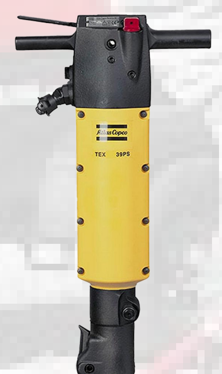
TEX 39 PS