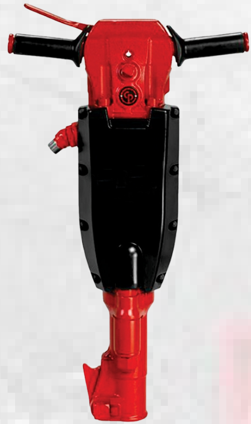
CP 1290 SVR