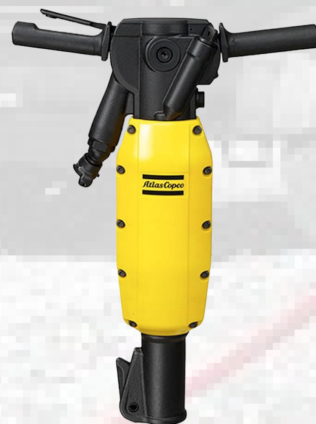
TEX 190 PE